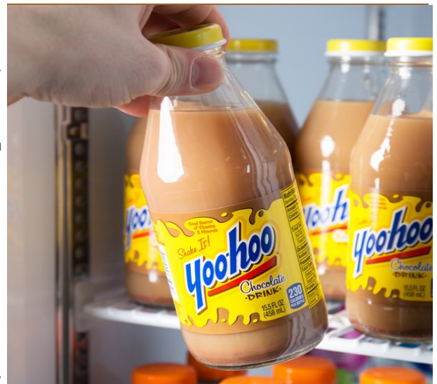
Actual color of Hayes Creek after a heavy rain.

My uncle caught 6 or 7 brownies between a foot and 16 inches, in addition to missing and losing a few in the process: including one unseen fish, that we'd have to guess was about 19 inches. For myself, I only remember catching one trout and it wasn't much of a fish by a ruler's standards, but I was lucky to catch it in the muddy water because I was fitted-out with a floating 6 weight line and some personally tied flies that were destined to ride way too high in the silty water to be noticed by anything but me. Ideas of how to effectively fish flies in those conditions wouldn't occur to me for a few more decades. Even after I acquired that knowledge, I would have been hard pressed to match my uncle's performance that day in 85.