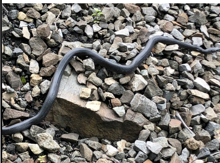
Rat Snake: photo-decapitated in frame

A video of the tributary survey will be posting a video of the survey on facebook at some point so keep an eye out for that.