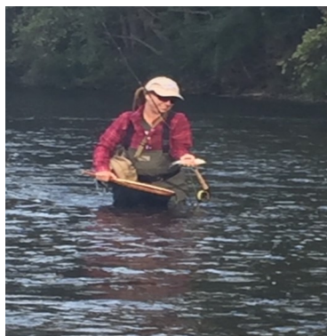
Wild Brown caught while nymphing near Slatington.

I had the pleasure of attending the Fly Fishing Show in NJ this January, and while this was my 2 nd time going it was my first as a fly fishing enthusiast who happens to be a woman. At this year's show they had a special women's showcase with classes and a spot on the showroom floor designated for women. While initially I balked at this because I have never been a fan of specializing something based on gender, I was curious to say the least. I had to laugh when I saw the area on the showroom floor, it was in the back corner, and I heard Patrick Swayze in my head saying 'They put baby in the corner.' It was nice though, and Orvis even had a booth where a female angler was there to help you try on