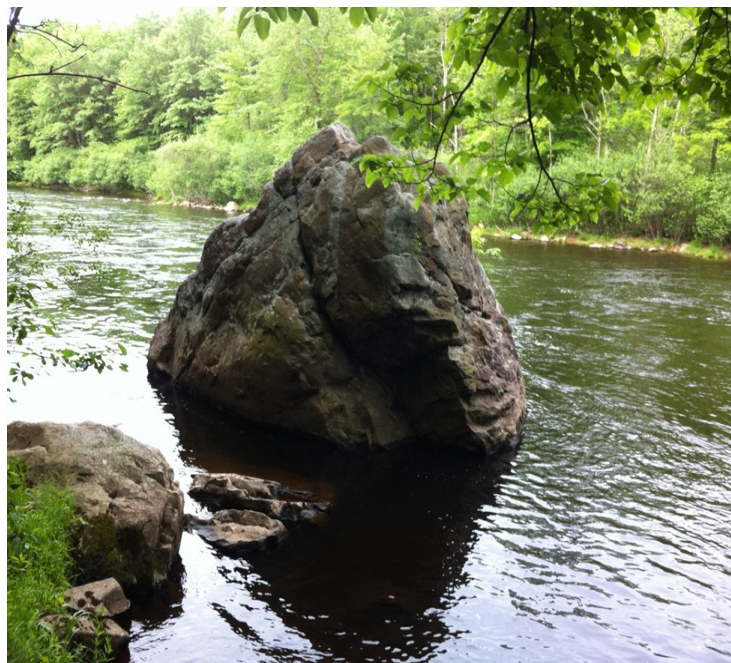
Car sized boulders provide structure and deep channels that attract trout. A common sight throughout the Gorge.