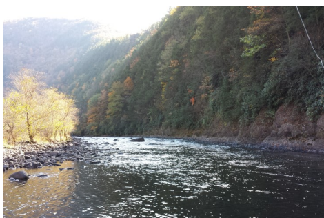
Fall Picture from Lehigh Gorge